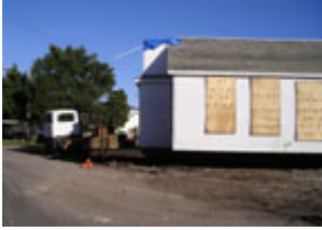
The church traveling down Lighthouse Road: